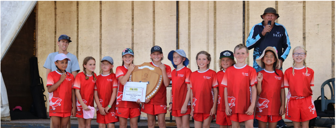
Paengaroa School Red Team win Top School 2024 . Their fourth winning year in a row.